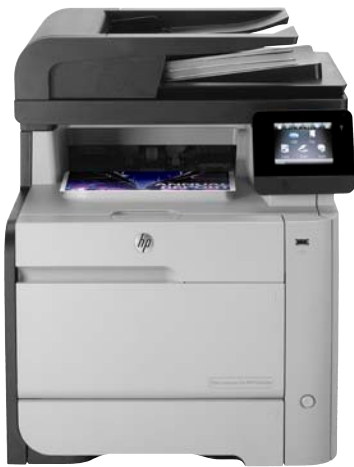
HP Color LaserJet Pro MFP M476 series

This HP Color LaserJet Pro MFP connects the whole office to vibrant color printing, even on the go 1,3,4 —and improves productivity with fast, versatile scanning that can send documents directly to email, network folders, and the cloud.