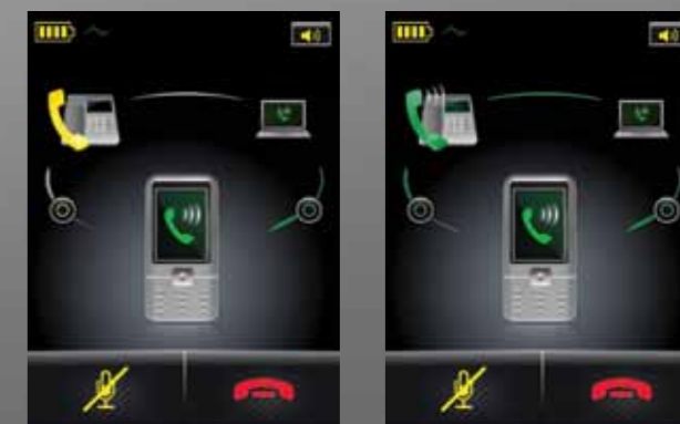
MERGING A CALL

It's easy to get started, too. A SmartSetup wizard on the touch screen guides you through the simple process of connecting phones and choosing preferences to get you started in minutes. Once you're up and running, the screen's colorful icons and intuitive menu system make call-handling a breeze.