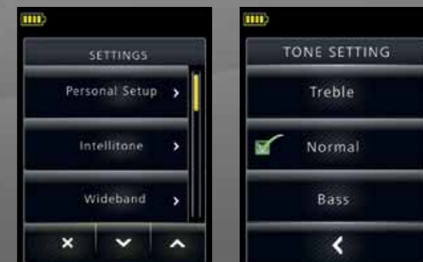
PERSONALIZING THE HEADSET