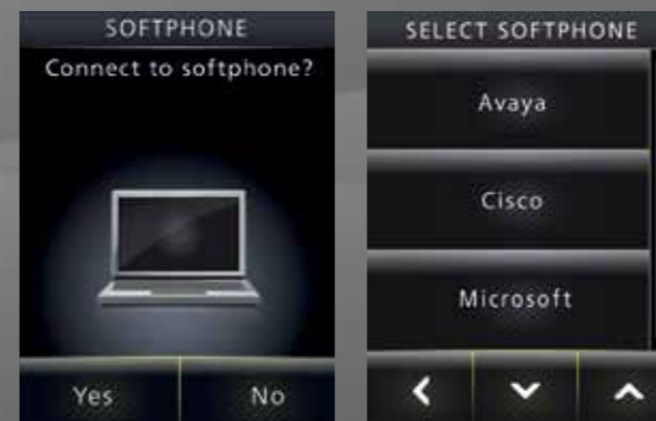
SETTING UP THE HEADSET