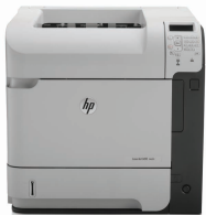
HP LaserJet Enterprise 600 M603dn