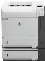
HP LaserJet Enterprise 600 M603xh