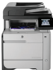
HP Color LaserJet Pro MFP M476dw