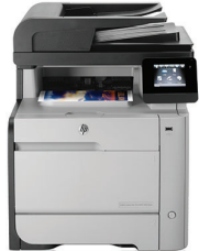
HP Color LaserJet Pro MFP M476dn