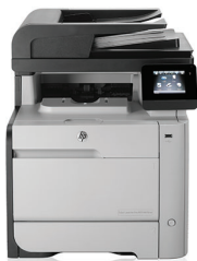
HP Color LaserJet Pro MFP M476nw

This HP Color LaserJet Pro MFP connects the whole office to vibrant color printing, even on the go 1,3,4 —and improves productivity with fast, versatile scanning that can send documents directly to email, network folders, and the cloud.